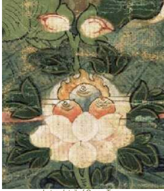
Lotus detail of Green Tara