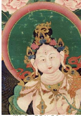
White Tara @ Rubin Collection